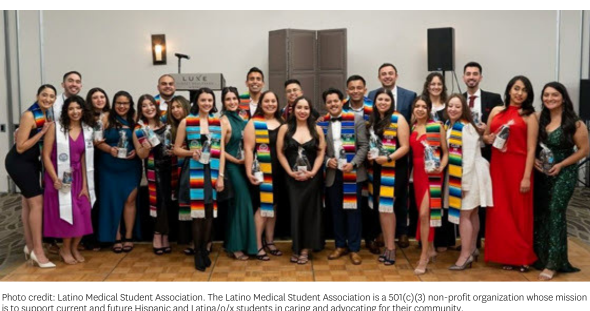
The Latino Medical Student Association is a 501(c)(3) non-profit organization whose mission is to support current and future Hispanic and Latina/o/x students in caring and advocating for their community.