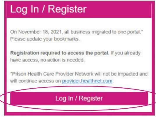
Screen shots may not match the current look of the provider portal.